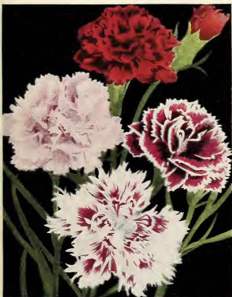
Grenadin Hardy Pinks

B ECAUSE we are specializing particularly in the production of Hardy Perennial Plants, and because we are growing them in great quantities by the most economical methods, we are able to supply splendid heavy plants at prices considerably lower than present average trade quotations.